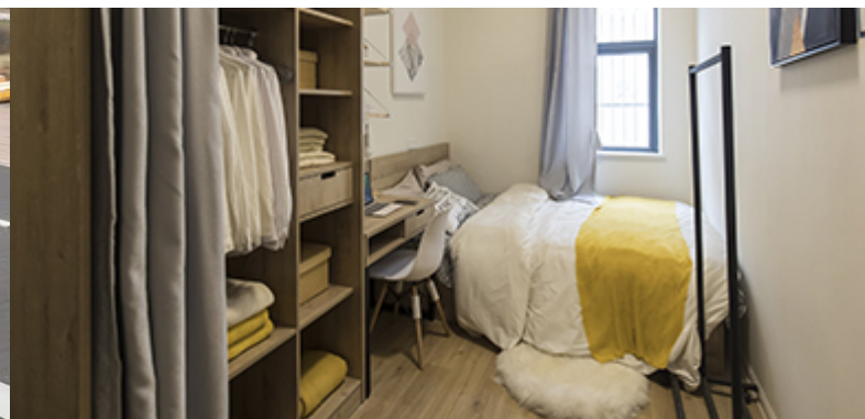
SKAGEN m2 added the Chinese developer Vanke to the portfolio in Q2.