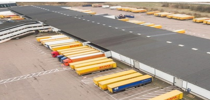
The logistics operator Catena also continued to add assets and is performing well.

The worst contributor was Argentinian IRSA despite good operational performance and positive corporate news. The reason for the unfavourable outcome for the stock is the Argentinian macro and currency environment. However, at the end of the quarter it was announced that Argentina will be a member of the MSCI Emerging Market Index in 2019, which is very positive. Operationally IRSA is performing well and trading at very depressed valuations. The next catalysts for Argentina's equity market are likely to be central bank's ability to stabilise the currency, the government's approach to gathering support for the 2019 budget, fiscal compliance with the IMF and the start of a new monetary easing cycle. There was no negative company news from the second worst performer of the quarter, Brazilian MRV Engenharia either. Rather the negative macro and currency developments have affected performance.