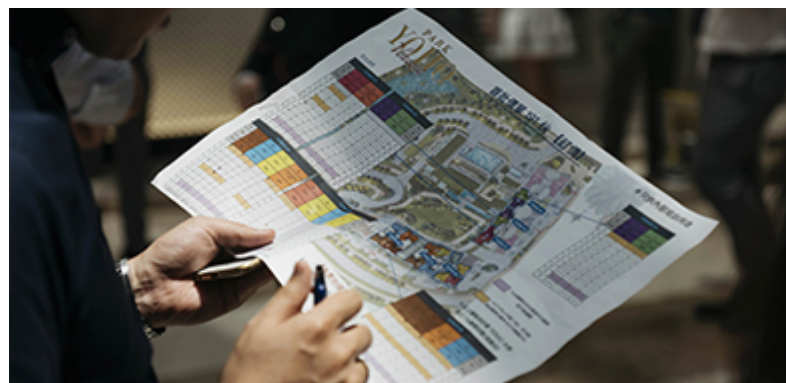
Hong Kong based Sun Hung Kai Properties is a new position in the fund.